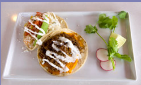
Comida Cantina serves delicious Mexican food with a Southern influence