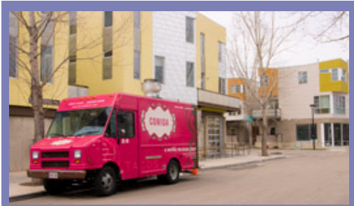
'Tina', the Comida food truck, in front of Comida Cantina in Longmont